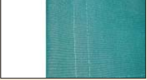
Traditional Sewn Side Hem